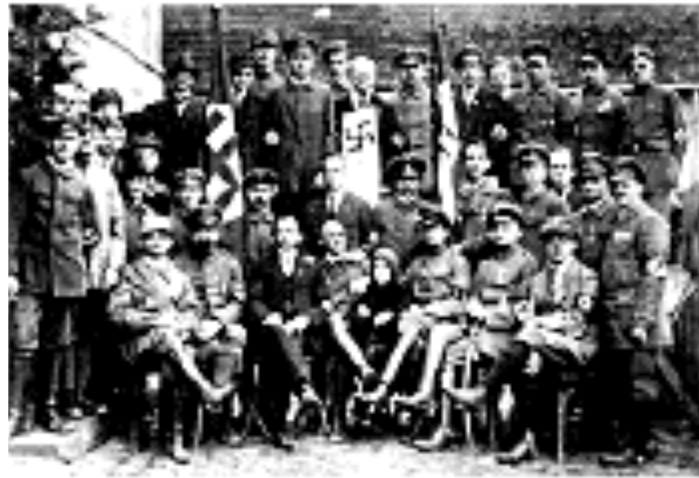
1922: Nazi party members.