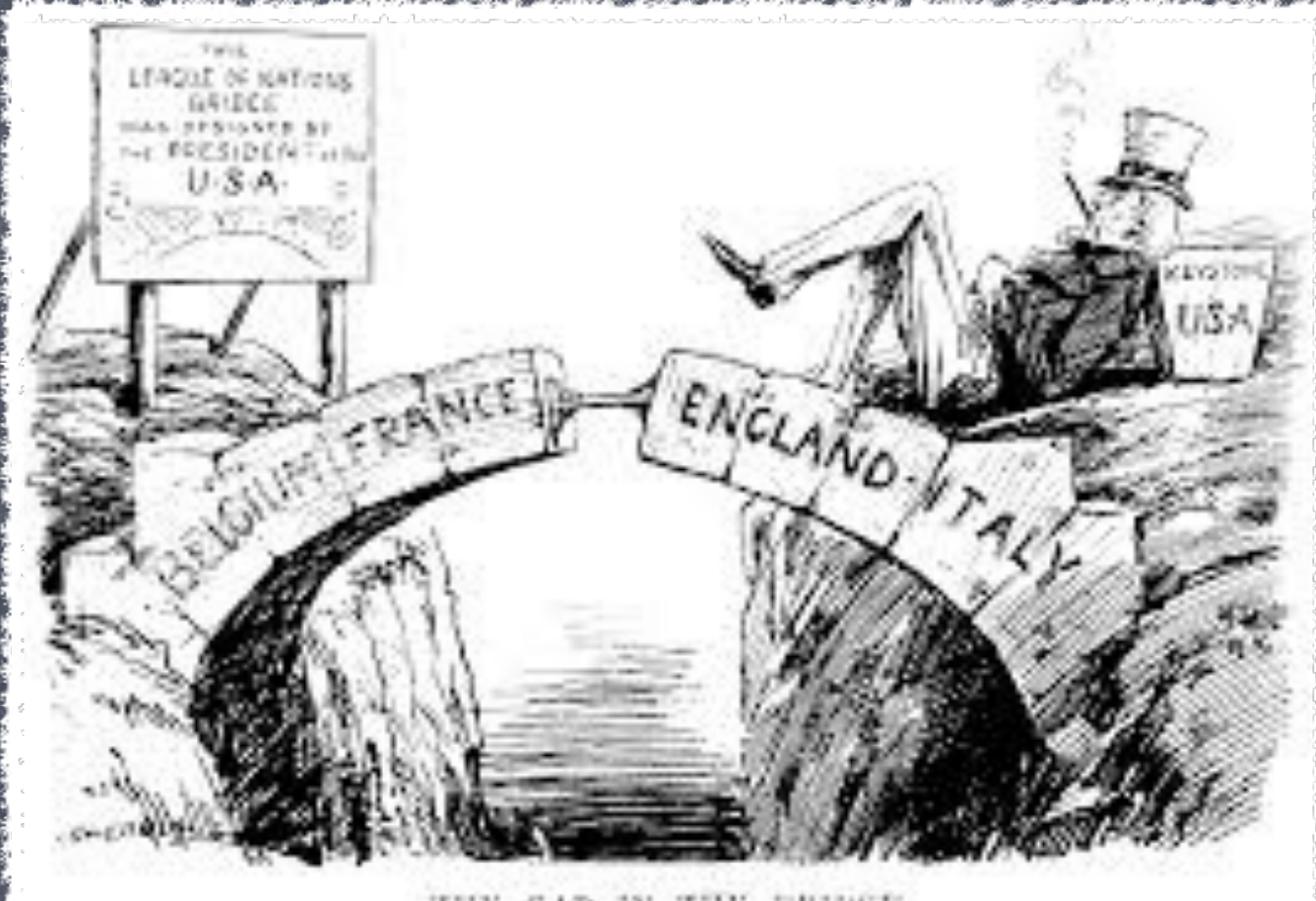
THE GAP IN THE PRIDGE