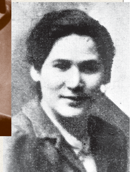
► Roza Robota